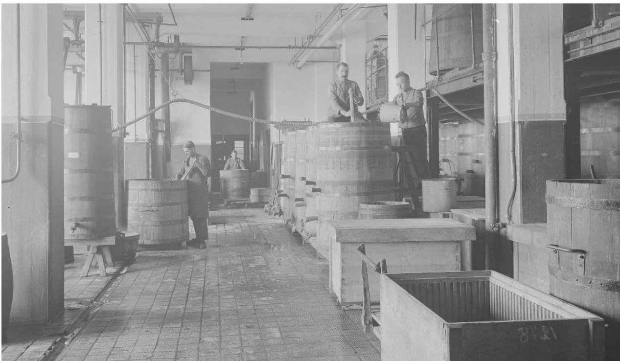
INK CELLAR 1923

WE SERVE ALL OUR DRINKS OPTIONALLY WITH OR WITHOUT SEPIA INK.